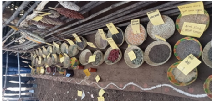
30 kg of seeds of local varieties were collected for saving and distribution