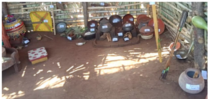
Local varieties of various plants were planted and displayed

1) The Kudrati Darshan Mela (Nature Festival) was attended by more than 800 tribal people and a total of Rs 80,870/- was spent by the people of the region for this mela. Two children from the 9th Standard, Ramiben and Paresh bhai of Kanalva coordinated the proceedings. The activities at the mela included discussion on nature philosophy and lessons to be learnt about the same from the Vedas. A report on the treatment of livestock attacked by lumpy virus during COVID was also shared.